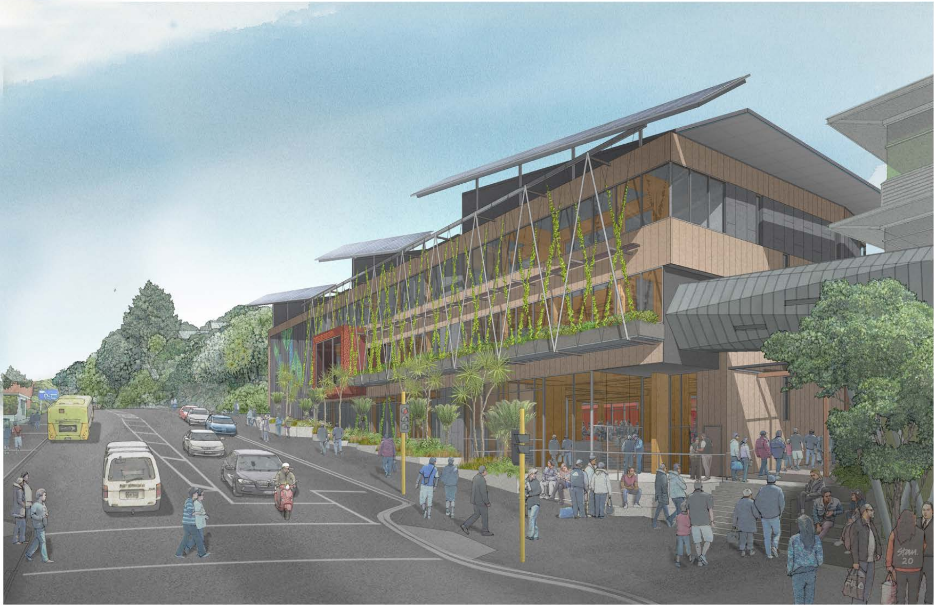
Illustration by www.stantialstudio.co.nz ©