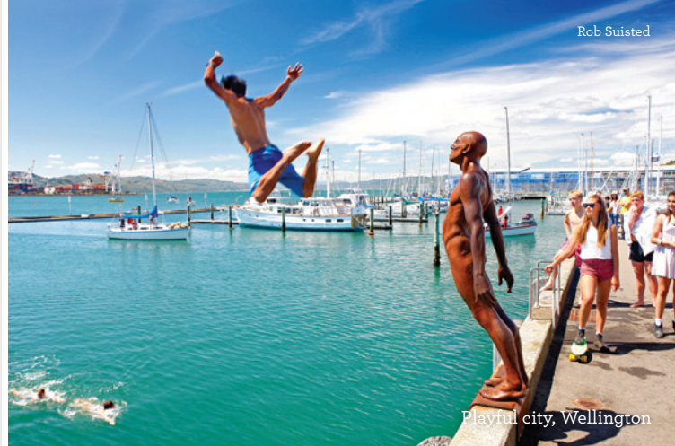
Playful city, Wellington

All these venues are within five minutes' walk of each other, allowing organisers to build a varied and easily managed programme.