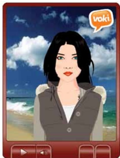
One of the avatars used to teach students online.

Learning in dance and drama has traditionally involved face-to-face tuition, but that may change as a result of research into the potential of online specialists supporting classroom teachers.