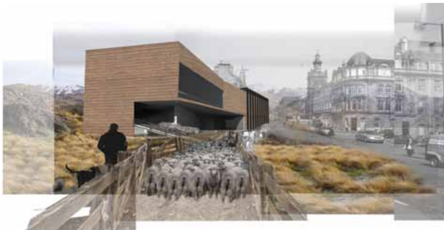
Kotahitanga Farm livestock entrance—a speculative urban merino farm design.