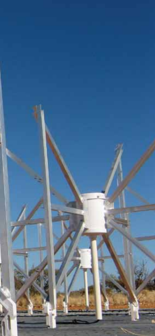
The Murchison Widefield Array near Perth.