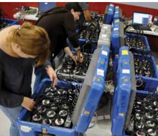
Some of the project team preparing the seismometers before they are deployed in the field.

Detonating 500 kilogram loads of dynamite in deep bore holes from Kapiti to Martinborough has helped scientists map Wellington's earthquake risk.