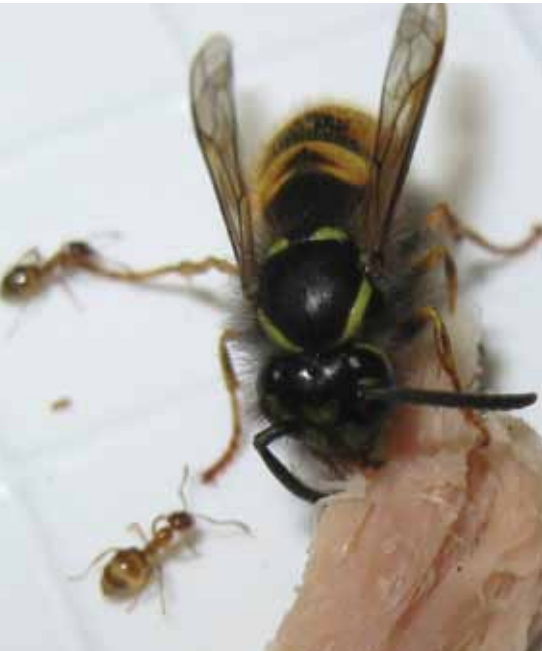
Wasps and ants are known to compete for food, although some research suggests the ants may actually attract wasps.

Wasps frustrated by having to compete with ants for food are picking the ants up, flying off and dropping them away from their meal.