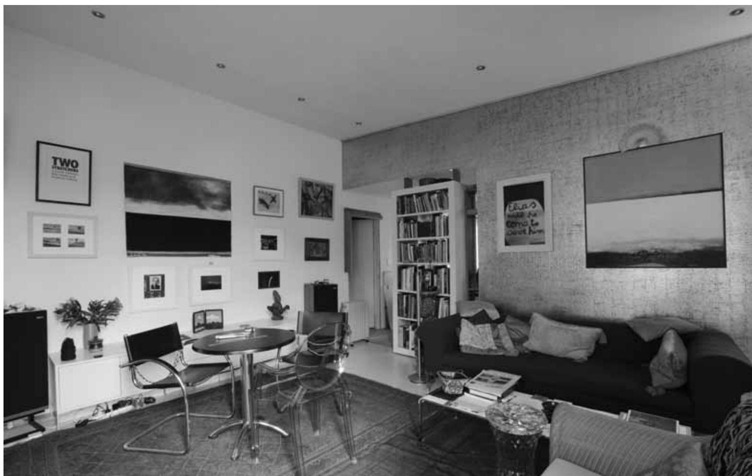
From the series 'Behind Closed Doors', 2011.