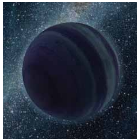
Artist's impression of a free floating planet. Image: Ian Bond

Download a PDF here: http://bit.ly/qk3auW