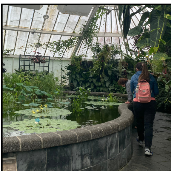
The CRF Women's Walking Group

The ideas for each group's design are written in a project proposal report. This report has recommendations but should be flexible enough to work for the resettled community and CRF.