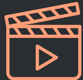
INFORMATIONAL VIDEOS & RESOURCES

The application is currently at the prototype stage. Please contact dayna.lindsay@huttvalleydhb.org.nz if you would like further information