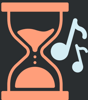
BRUSHING TIMER WITH WAIATA