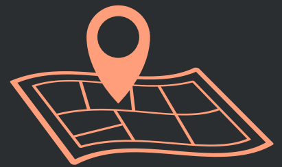
MAP OF DENTAL HUBS