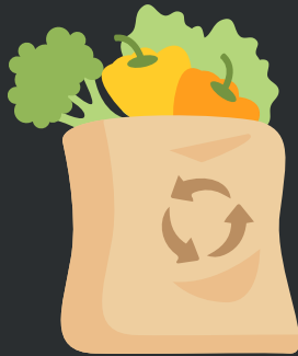
NUTRITION BASED GAME