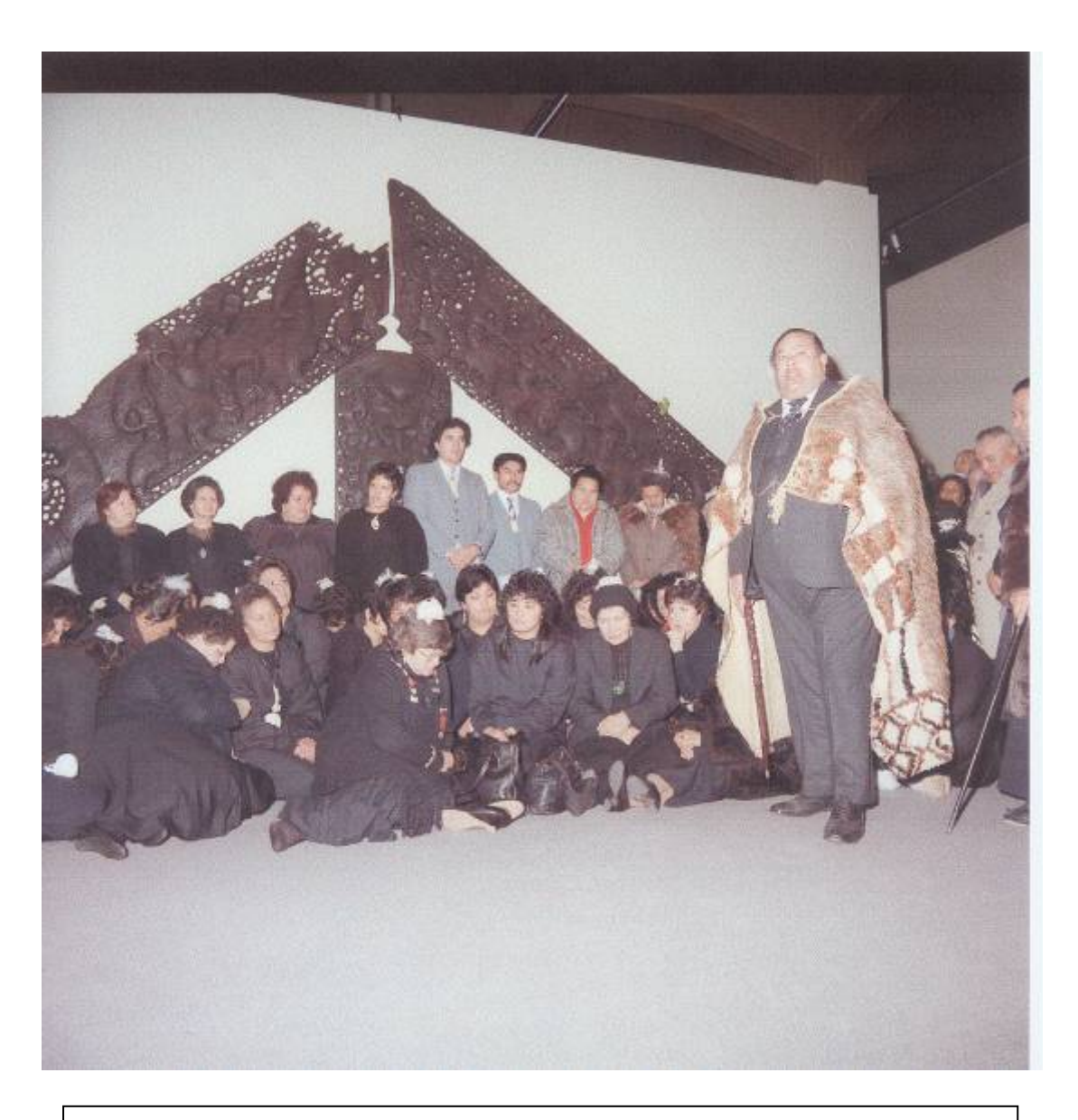
Maui Pomare at opening of Te Maori, National Museum Wellington, 1986