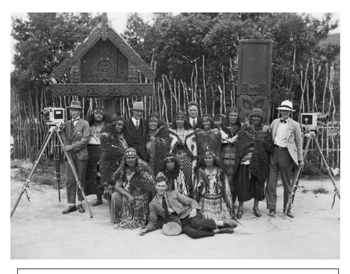
Māori guides and photographers at Whakarewarewa 1920s