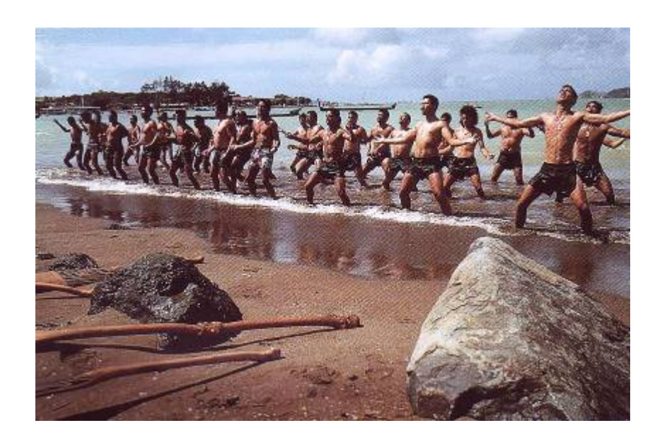
Waka regatta as part of Waitangi Day celebrations, 1990