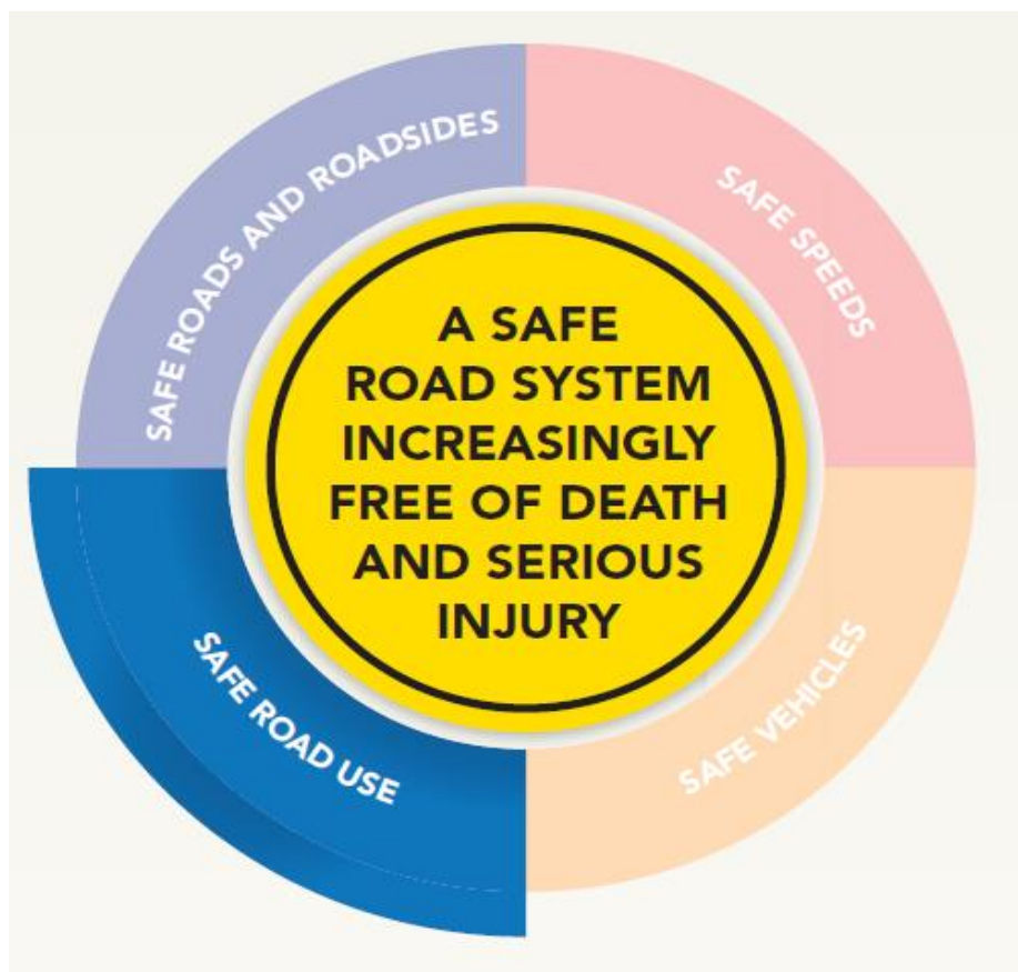
Figure 4: Safer Journeys 2010-2020

Drug-driving is one of the serious causes of driver impairment identified in the Road Safety Strategy 2010–2020, Safer Journeys (see Figure 4). The Safer Journeys Road Safety strategy is agreed to by Cabinet. Action plans which stem from the Strategy are agreed by the National Road Safety Committee. Road safety strategies have been in place for more than a decade and therefore the drug-driving work was able to draw on significant corporate capability and experience built up over that time. Within NZTA there was a hard-nosed focus on the effectiveness of whatever was done. This was combined with openness in NZTA to new ways of connecting effectively with drug-using drivers and the people they share the road with.