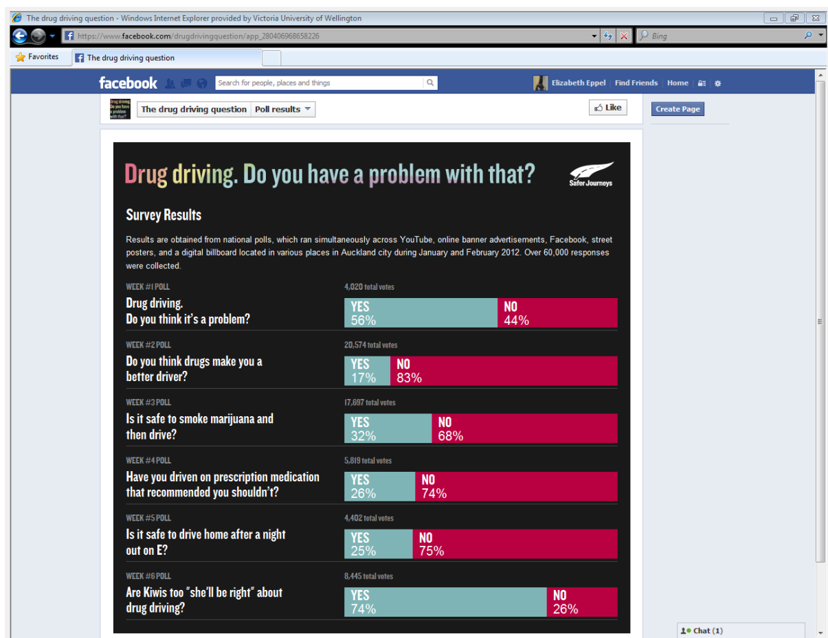
Figure 3: Facebook Page The drug driving question and poll results

As well as over 5000 ‘likes’ on the drug driving Facebook page, the maximum number of people engaging with the page content reached nearly 17,000. Twitter and blog sites were monitored for mention of the drug driving question. Information from the campaign was retweeted and mainstream media such as talkback radio and news items on radio, newspapers and television mentioned the questions and the responses being received from the public.