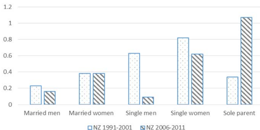
Figure 1: Uncompensated Wage Elasticities: New Zealand 1991-2001 and 2006-2011

intervals). In calibration and non-calibration calculations a total of 100 sets of random draws was used for each individual.